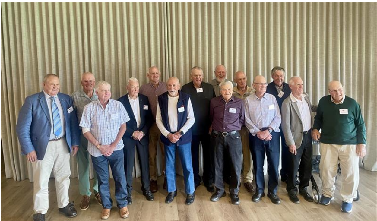
Members of the 1965 team.

Players from the 1965 premiership team gathered at Windy Hill in late March 2025 to reminisce about their premiership season.