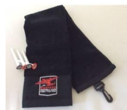
Golf Towel $20.00