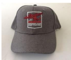
EFCPP&OA Adults Cap – Grey $20.00

Make sure you stock up on Essendon Football Club Past Players & Officials Association Official Merchandise!