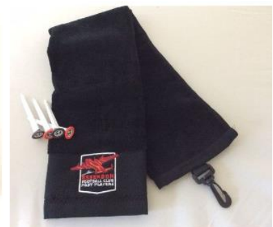
Golf Towel $20.00