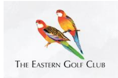
The Eastern Golf Club & Kelvin Steel