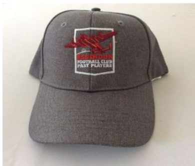
EFCPP&OA Adults Cap – Grey $20.00

Order online - https://essendonfcpastplayers.com.au/shop/