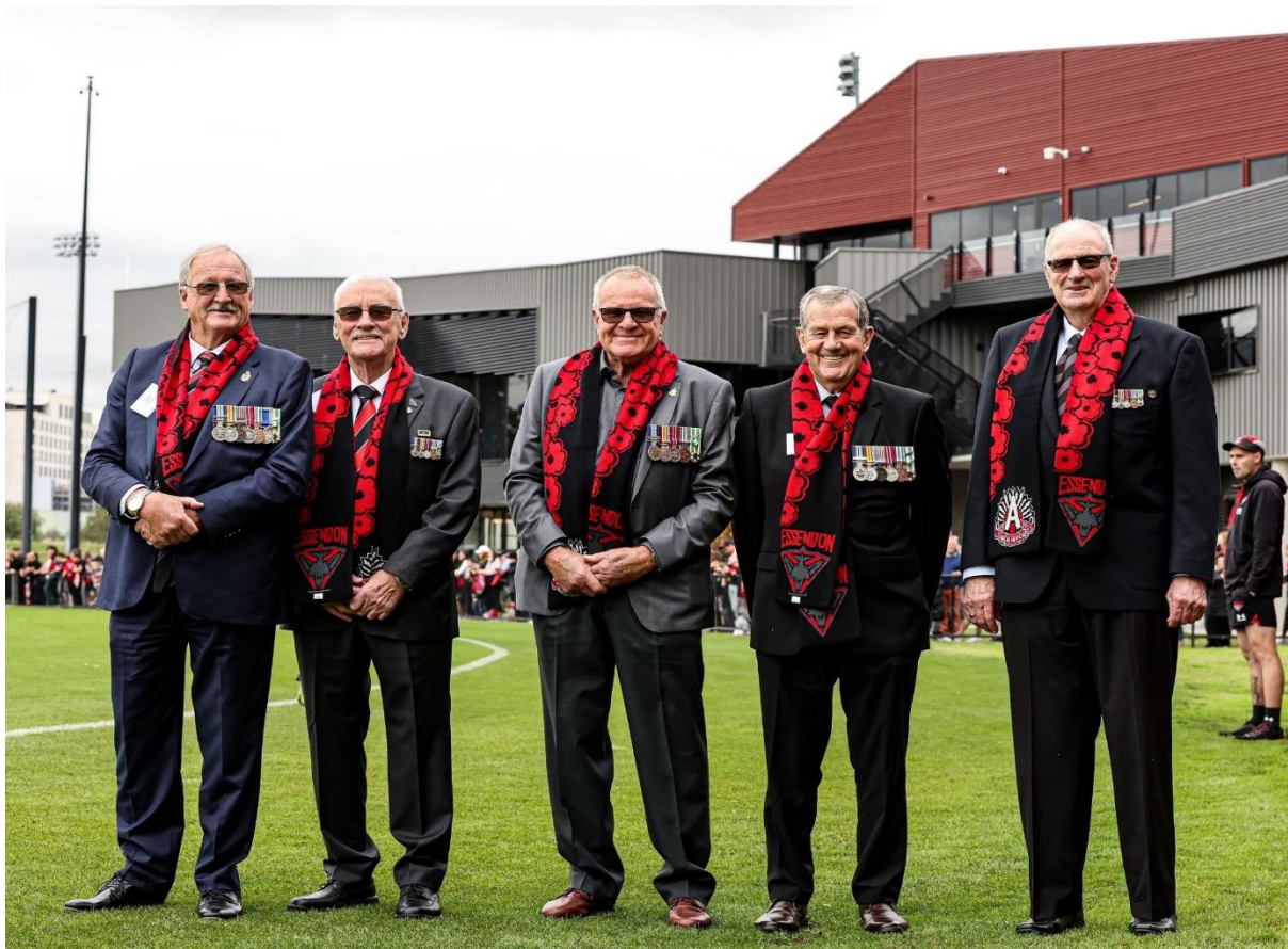
EFC Vietnam Veterans